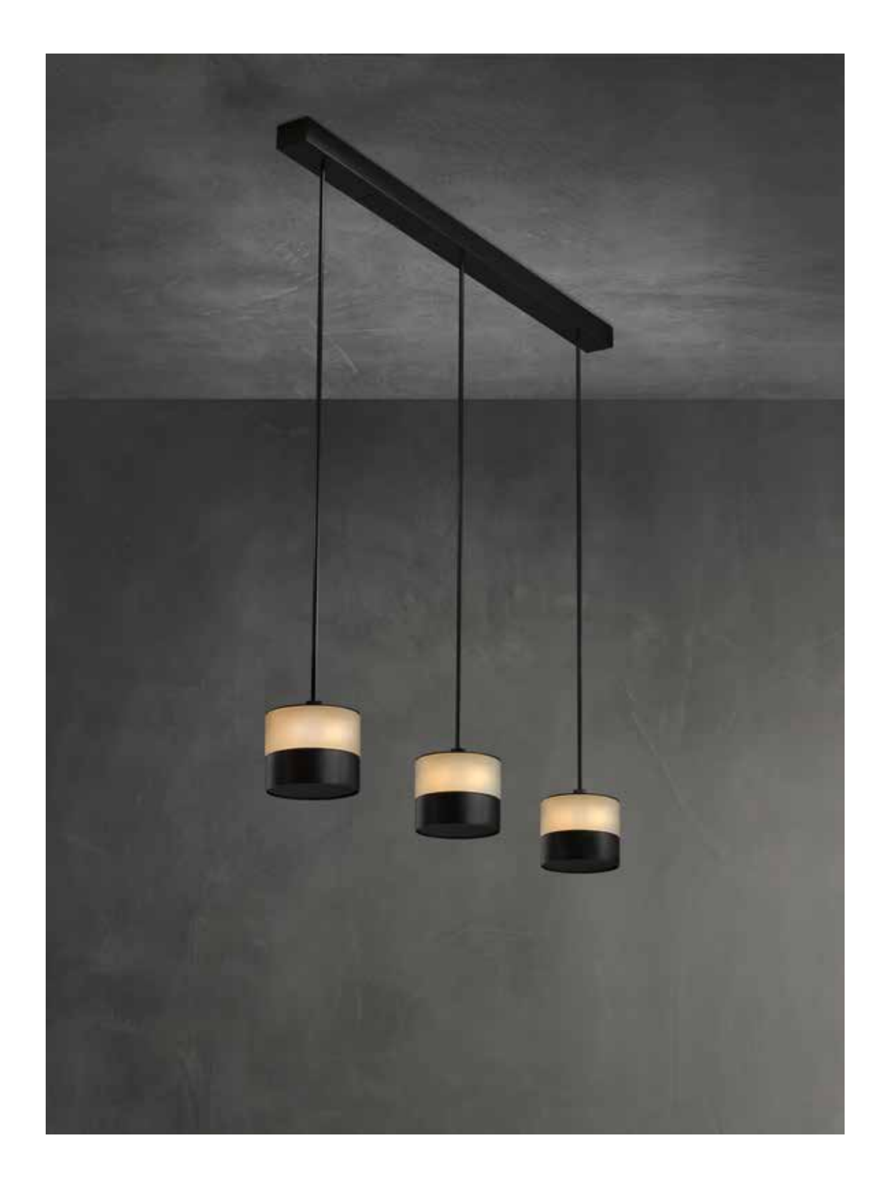
GLOW by HEATSAIL