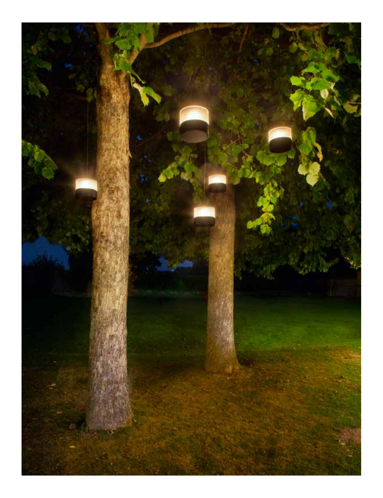
GLOW by HEATSAIL