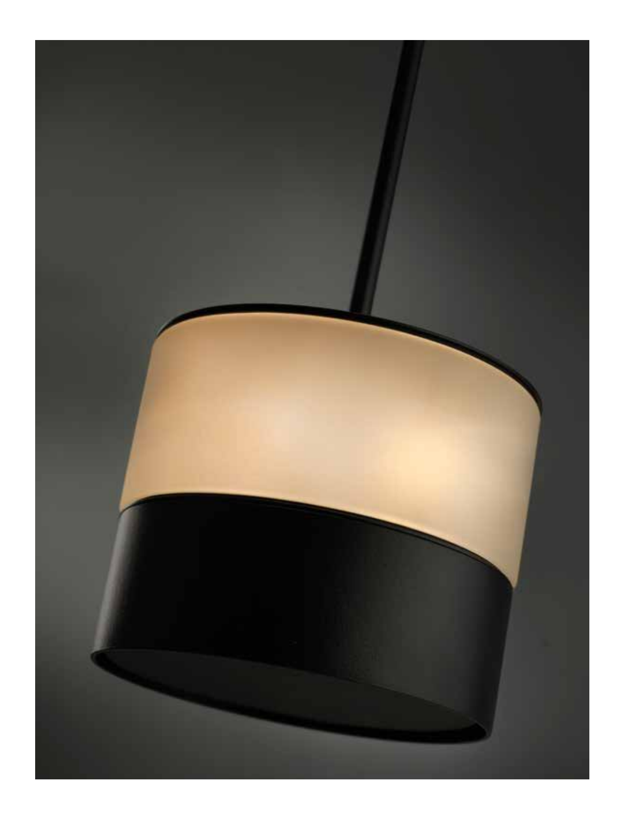
GLOW by HEATSAIL